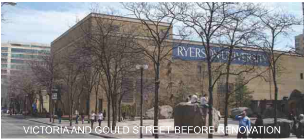
VICTORIA AND GOULD STREET BEFORE RENOVATION