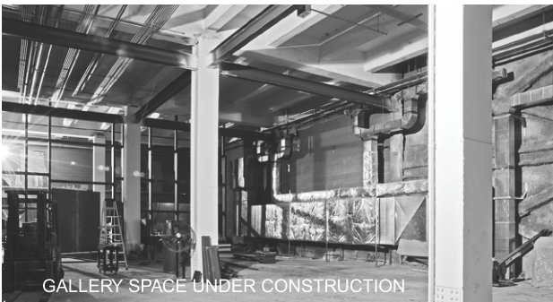
GALLERY SPACE UNDER CONSTRUCTION