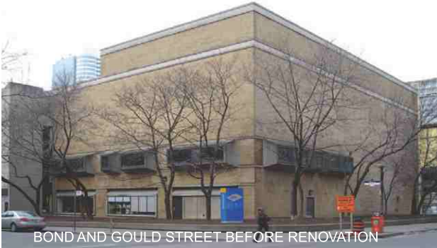
BOND AND GOULD STREET BEFORE RENOVATION