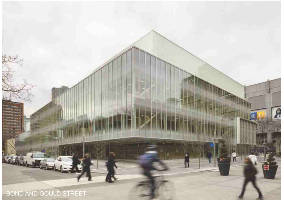
BOND AND GOULD STREET

The new Ryerson Image Centre is a renovation and expansion of the almost windowless former brick brewery distribution warehouse in downtown Toronto which has been home to the program for nearly fifty years. The new building features a transparent curtain wall system for program legibility and to dissolve barriers between indoor and outdoor public space on a high profile campus intersection.